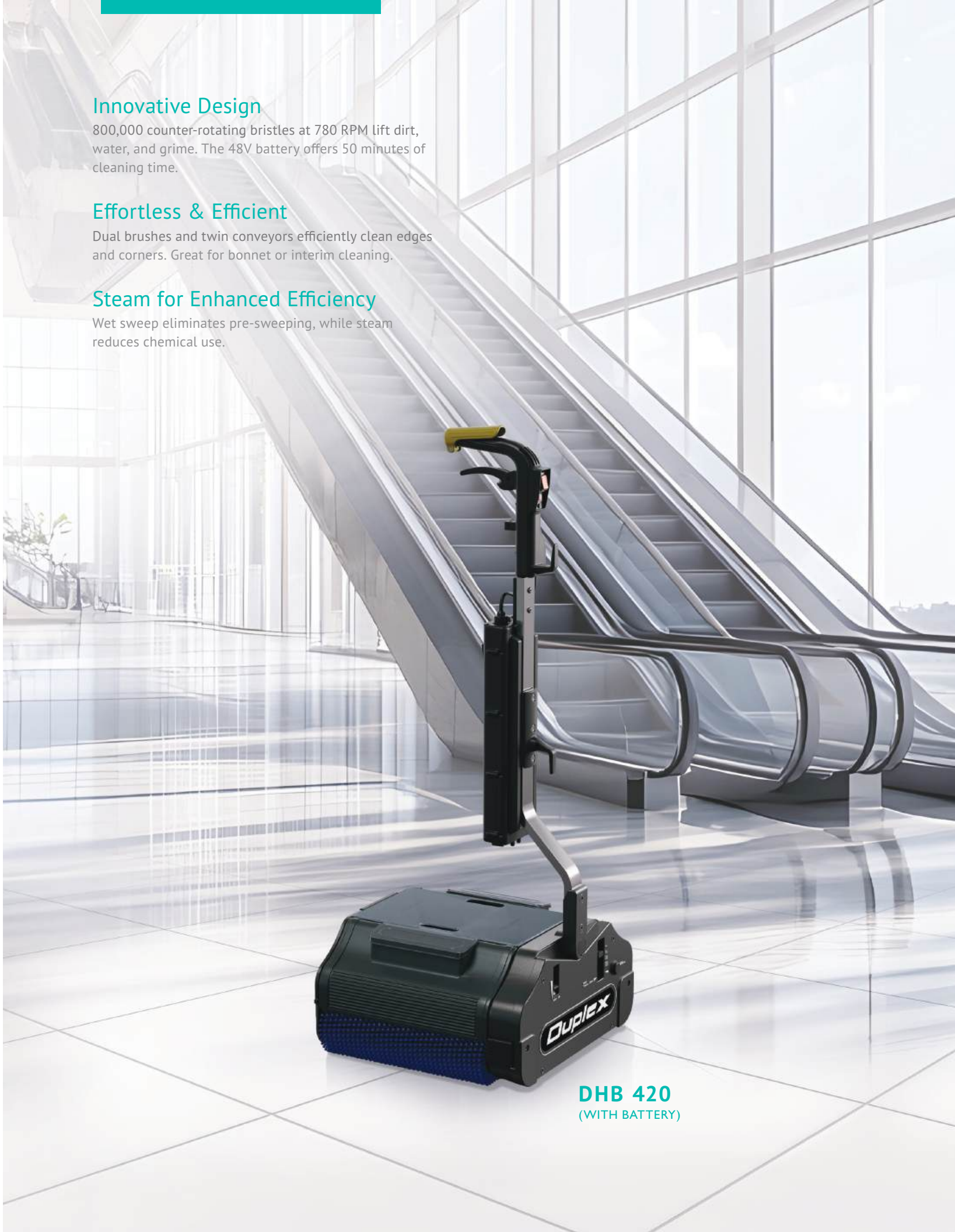
DHB 420 (WITH BATTERY)

Wet sweep eliminates pre-sweeping, while steam reduces chemical use.