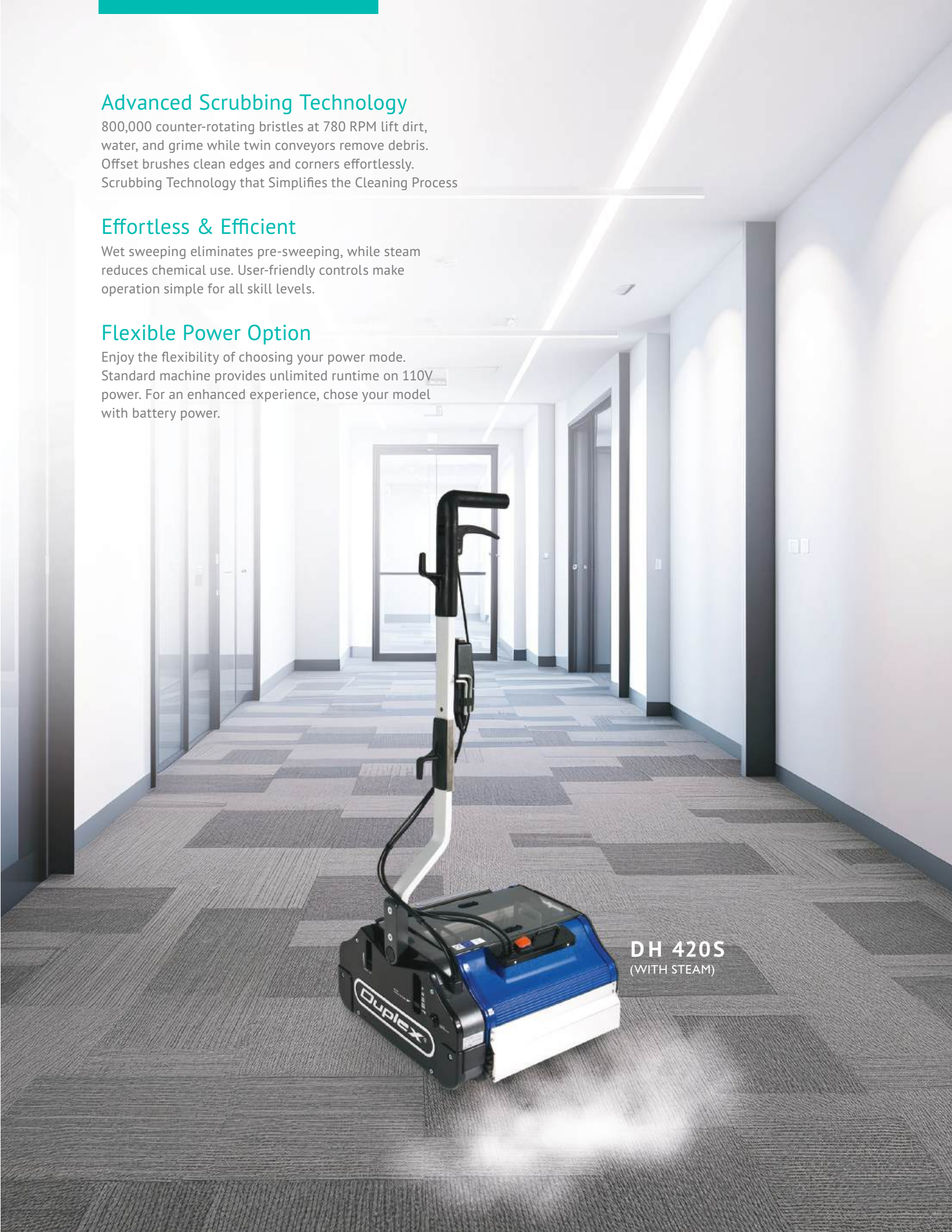
DH 420S (WITH STEAM)

Enjoy the flexibility of choosing your power mode. Standard machine provides unlimited runtime on 110V power. For an enhanced experience, chose your model with battery power.