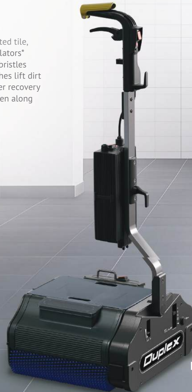
DH 420S (WITH STEAM)