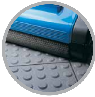
Profiled Rubber and Ceramic