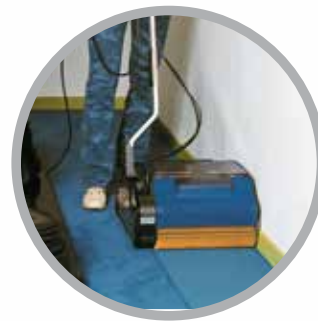
Clean right to the edge of walls